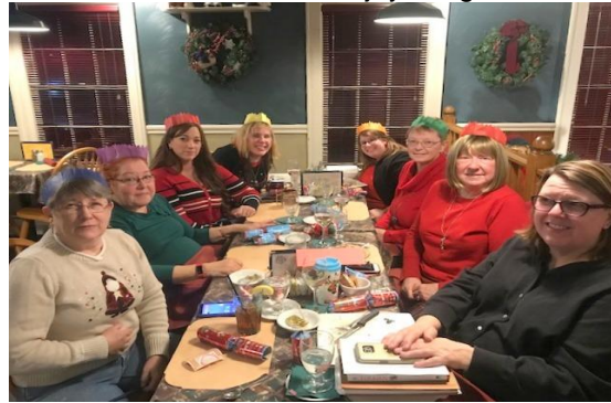
Christmas meeting of Books @ Boulevard