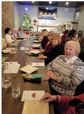
Happy AAUW Members