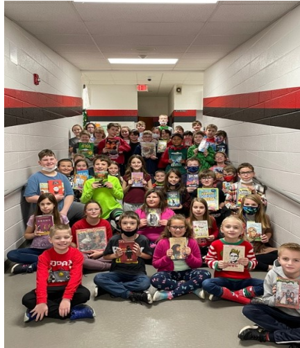
Conemaugh Township 4 th grade students participated in the AAUW Write-Read-Write Program.